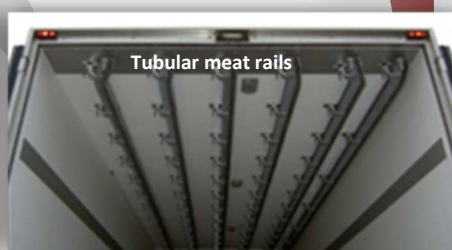
Tubular meat rails