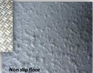
Non slip floor